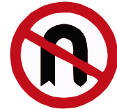
U turn prohibited