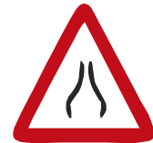
Narrow road ahead