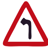
Left hand curve