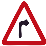
Right hand curve